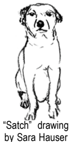
"Satch" drawing by Sara Hauser

Satch's Corner Where you can read about some good cd's, books & videos which can be purchased at www.sourceunitd.com through our affiliate program with amazon.com